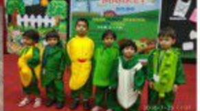
ORIENTATION WITH PARENTS